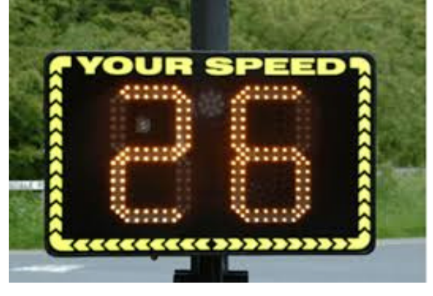
Parish/Town Council purchased SID