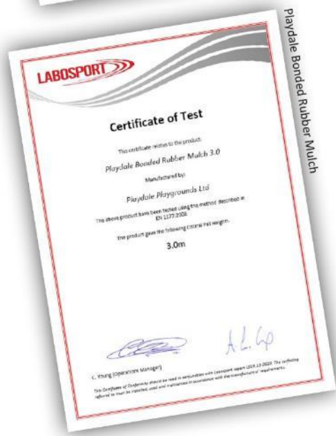
Playdale Bonded Rubber Mulch